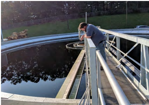
A utility mechanic inspects a mechanical arm on the Wastewater Treatment Plant's clarification tank, which sweeps the water surface of large organics and trash.

The town's approach to building its budget and a multi-year financial plan has been: 1) take care of what we've got, 2) invest for the future, and 3) minimize rate impacts on the community. The Fiscal Year 2021 budget was the first budget presented to Hillsborough's town board in 23 years that was not in a multi-year format. Hillsborough is one