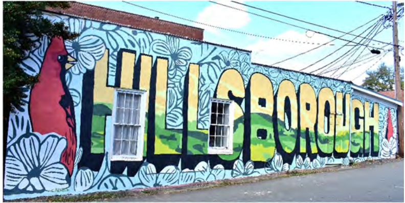
This mural was added in fall 2021 to the building that houses The News of Orange County newspaper in downtown Hillsborough.

The town's unemployment rate has been below state and national rates throughout recent history. Traditionally, Orange County has the lowest unemployment rate in North Carolina. This is in part due to a high percentage of residents working for area universities, hospitals, medical offices, and state and local governments that tend to not lose as many employees as private corporations during economic downturns. While there were concerns about the economy due to COVID-19, the issuance of building permits for residential and commercial developments, as well as frequent inquiries from developers, continued to be exceptionally strong through June 2022.