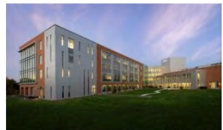
A new patient tower opened in May 2022 at UNC Hospitals Hillsborough Campus.

The campus is home for several UNC specialty programs, including family medicine, geriatrics, physical medicine, and rehabilitation, which is moving from Chapel Hill to Hillsborough. The hospital also has many elective surgical programs, including joint replacement, spine, ophthalmology, urology, benign gynecology, and general surgery. It is the first in North Carolina to receive the Geriatric Emergency Department Accreditation from the American College of Emergency Physicians and is one of about 20 hospitals accredited nationwide, certifying that its staff is specially trained to more comprehensively assess older patients. The campus also has earned the Joint Commission's Gold Seal of Approval® for Total Hip and