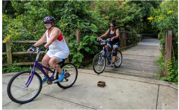
The Riverwalk greenway is a favorite destination.

The town’s 3 percent hotel/motel and 1 percent prepared food and beverage taxes have provided a dedicated resource for promoting Hillsborough as a destination for arts and culture, unique cuisine, outdoor recreation, and historical landmarks. While many events were canceled in 2020 and 2021 due to COVID, these activities have rebounded strongly with far more public events during 2022 than previous years.