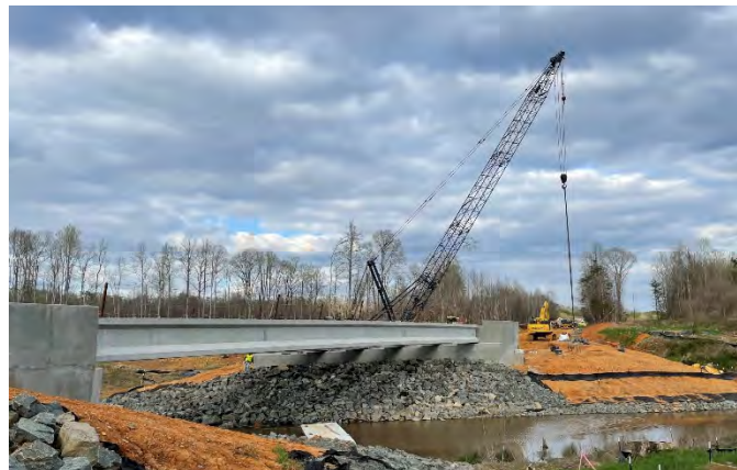
The expansion of the reservoir included replacing a bridge over the reservoir on Carr Store Road in Orange County.