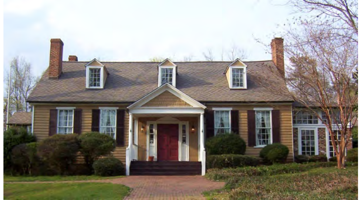
The historic Ruffin-Roulhac House, circa 1821, serves as Town Hall.

Founded in 1754, Hillsborough is the seat of Orange County. Located at the intersection of interstates 85 and 40, it is part of the region known as the Research Triangle and is close to several major cities, with Durham, Chapel Hill, Raleigh, and Greensboro nearby. Several universities are close to town — the University of North Carolina at Chapel Hill, Duke, Elon, North Carolina Central, and North Carolina State. Durham Technical Community College also has a Hillsborough campus. The town's economy is centered on government, retail, service providers, manufacturing, and health care including the UNC Hospitals Hillsborough Campus. The town's historical sites and its vibrant art, music, and food scenes attract many tourists and visitors.