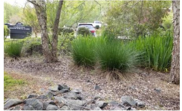
Bioretention Cell at Carolina Behavioral Care

Urban development projects often require stormwater control measures to meet development regulations. Each owner of a stormwater control measure is responsible for regular inspection and maintenance, which is important for protecting water quality.