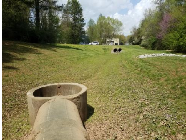
Sports Endeavors Dry Detention Pond

vegetation within and surrounding its pond and completes all inspections on time. Way to go, Heritage Townhomes HOA!