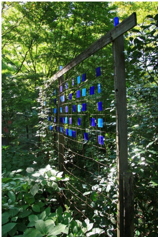
Glass Bead Screen