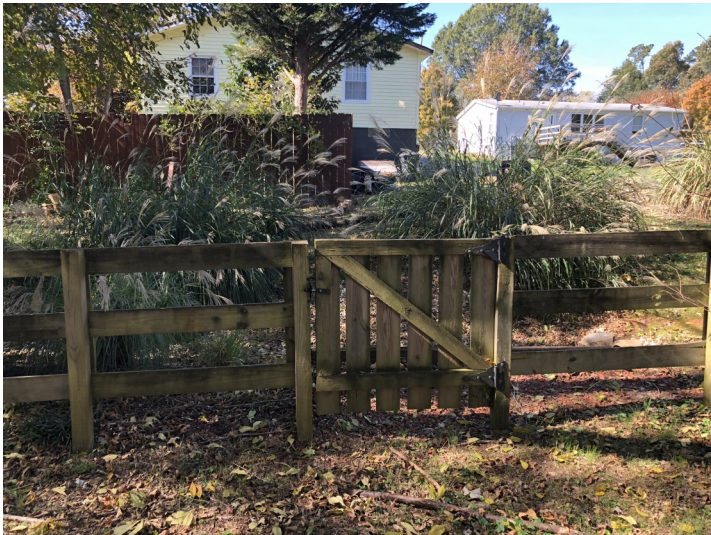
Gate at rear of the park