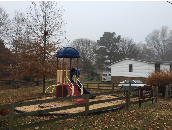
View of play equipment and front fence