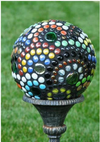
Beaded Garden Orbs