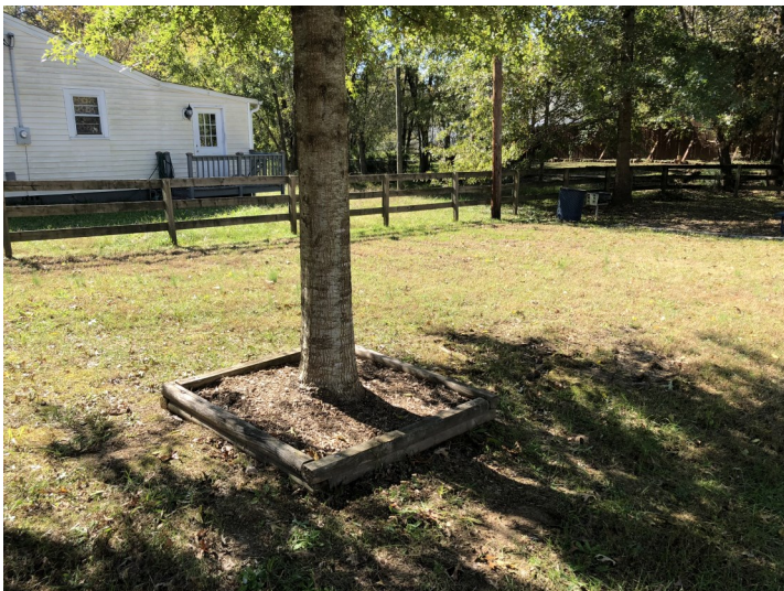
Base of maple tree in center of park