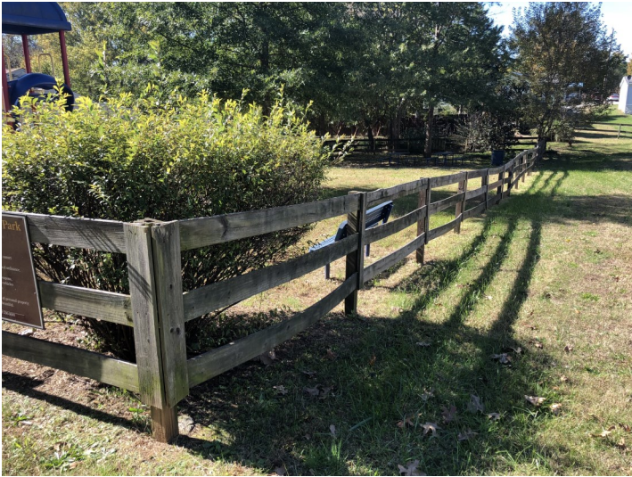
Fence on north property line