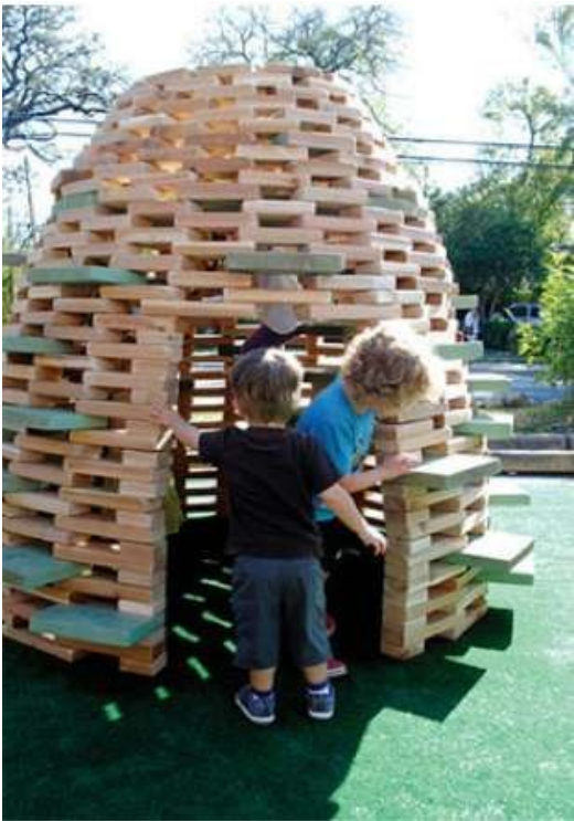
Beehive Play House