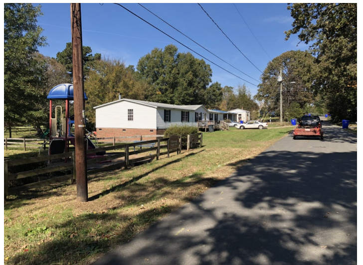
View of front fence and Terrell Road