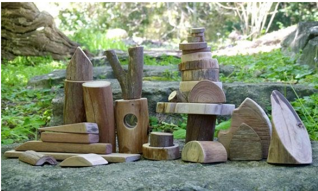
Natural Wood Blocks