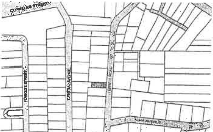
HILLSBOROUGH HEIGHTS PARK VICINITY MAP