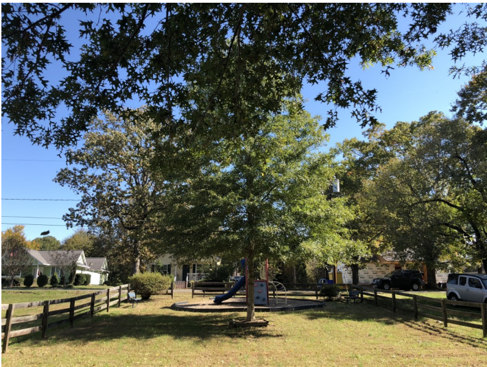
View looking east toward Terrell Road