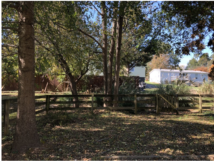
Shaded area at rear of the park