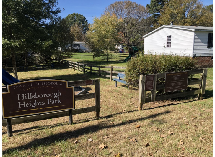
Front entrance to the park