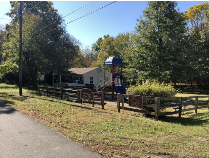
View of front entrance to park adjacent to Terrell Road