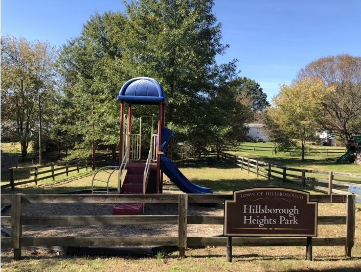
View looking west into the park

Below are a few pictures of existing conditions at Hillsborough Heights Park in 2018.