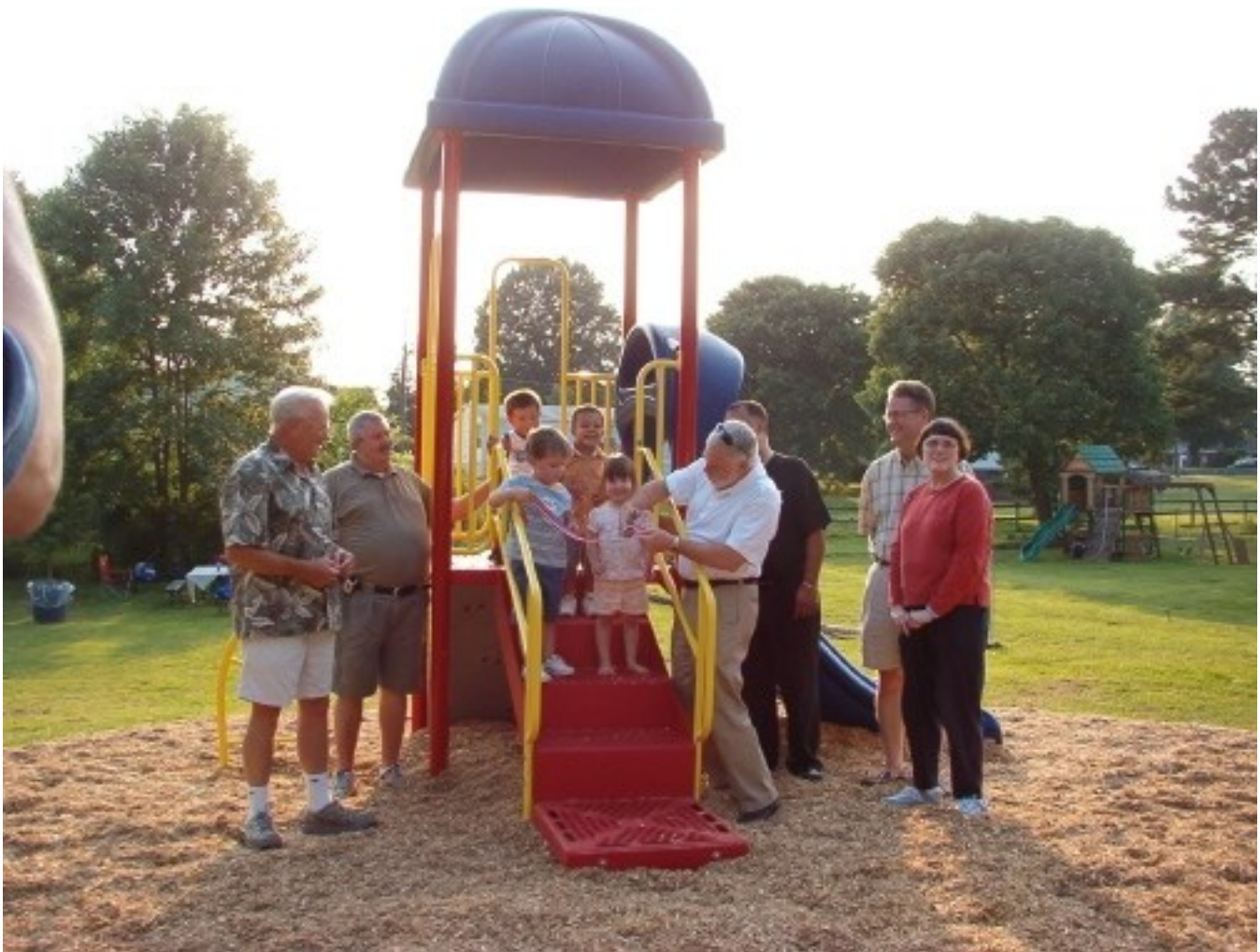
Ribbon Cutting Ceremony for Hillsborough Heights Park (June 2006)