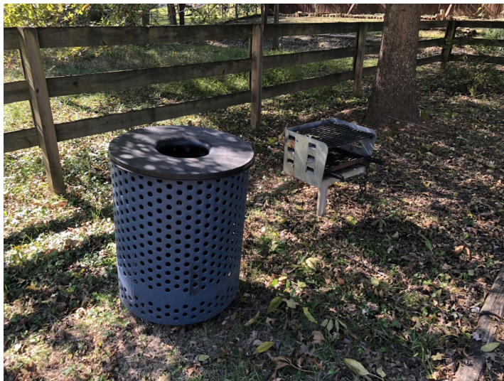
Trash receptacle and grill