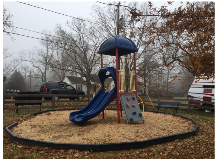
Play Equipment (ages 2-5)