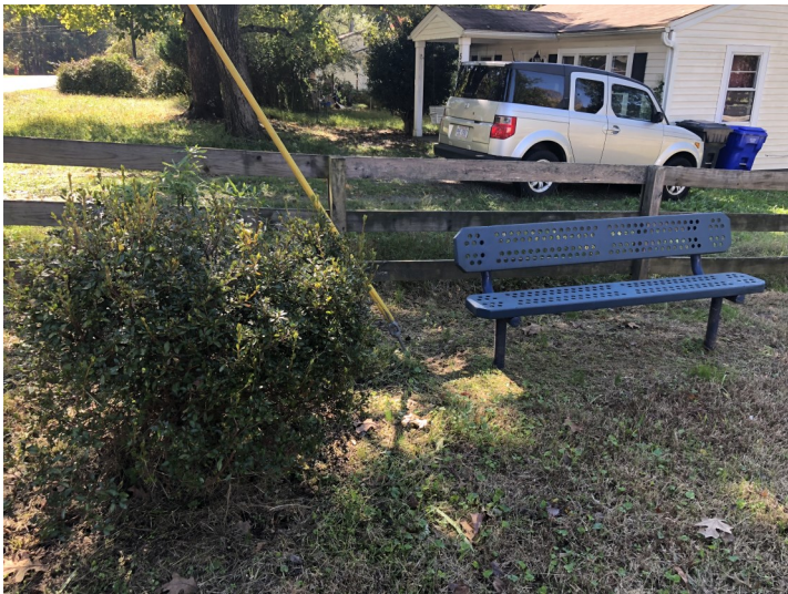
Landscaping and park bench