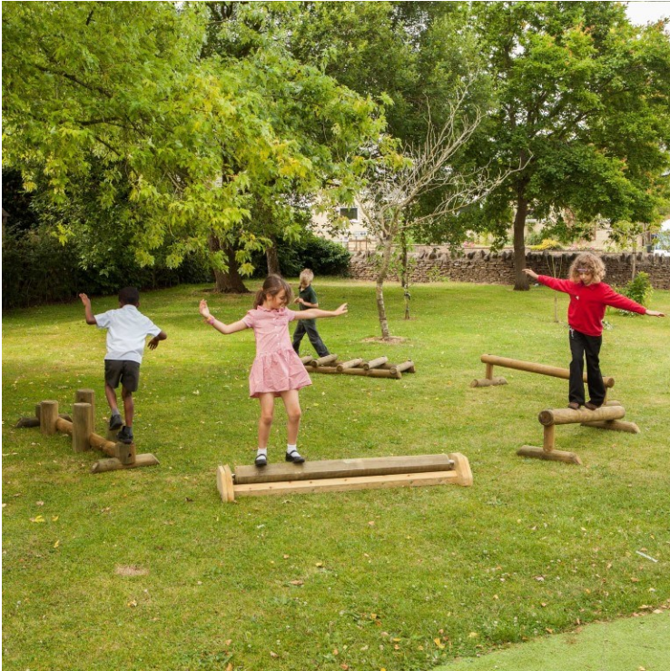
Low Balance Beams