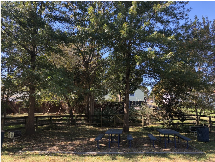
View of picnic area at rear of the park