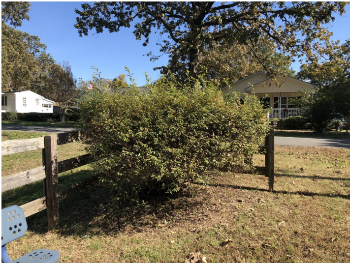
Landscaping near entrance